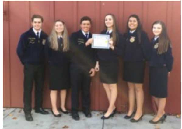
2017-2018 Officer Team

Learning to Do Doing to Learn Earning to Live Living to Serve